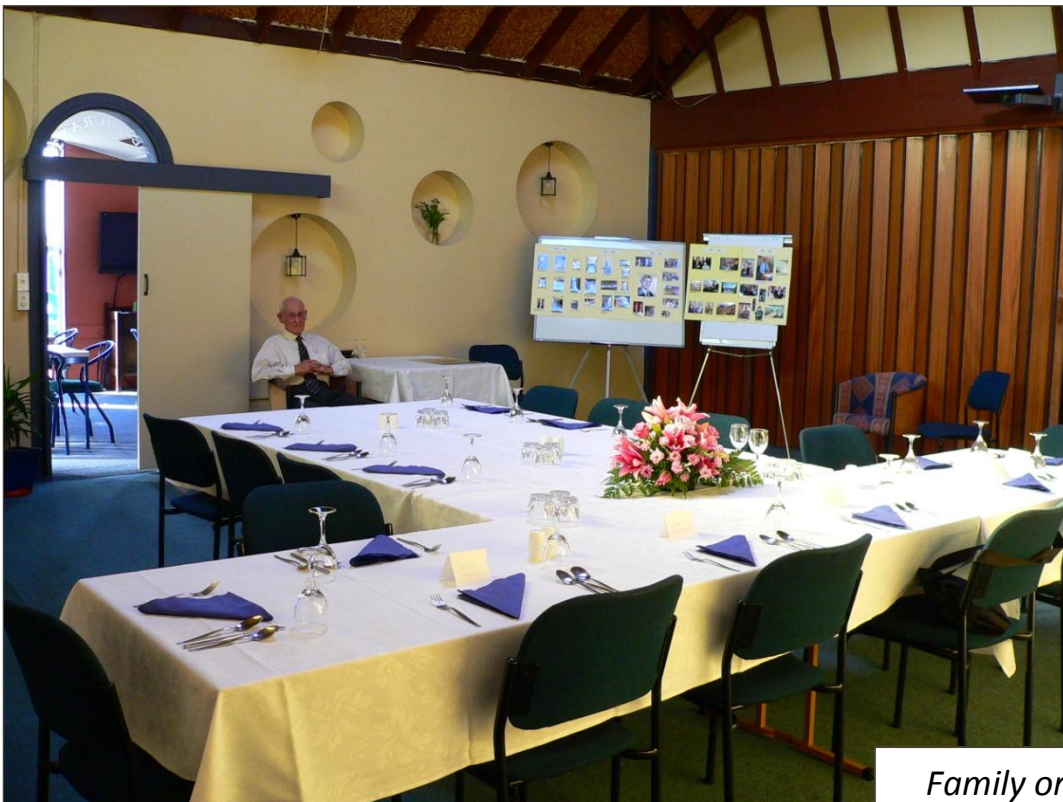
Family or other occasion